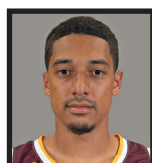
5 GOOD Gr. ▶ Guard

MIN. 19.9 PPG 5.3 RPG 1.8 APG 3.8 FG% 50.0 3FG% 43.8